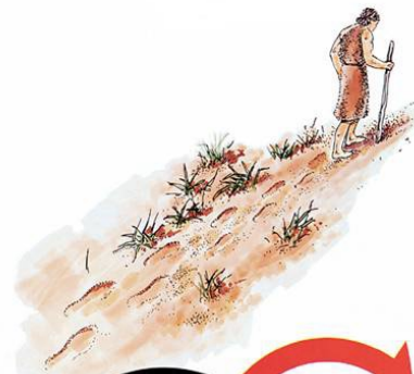
Enoch Genesis 5:18-24; Jude 14-15