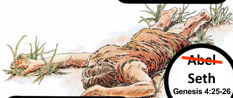
Abel Seth Genesis 4:25-26