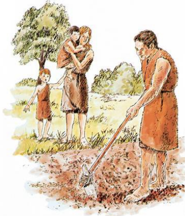
Adam and Eve